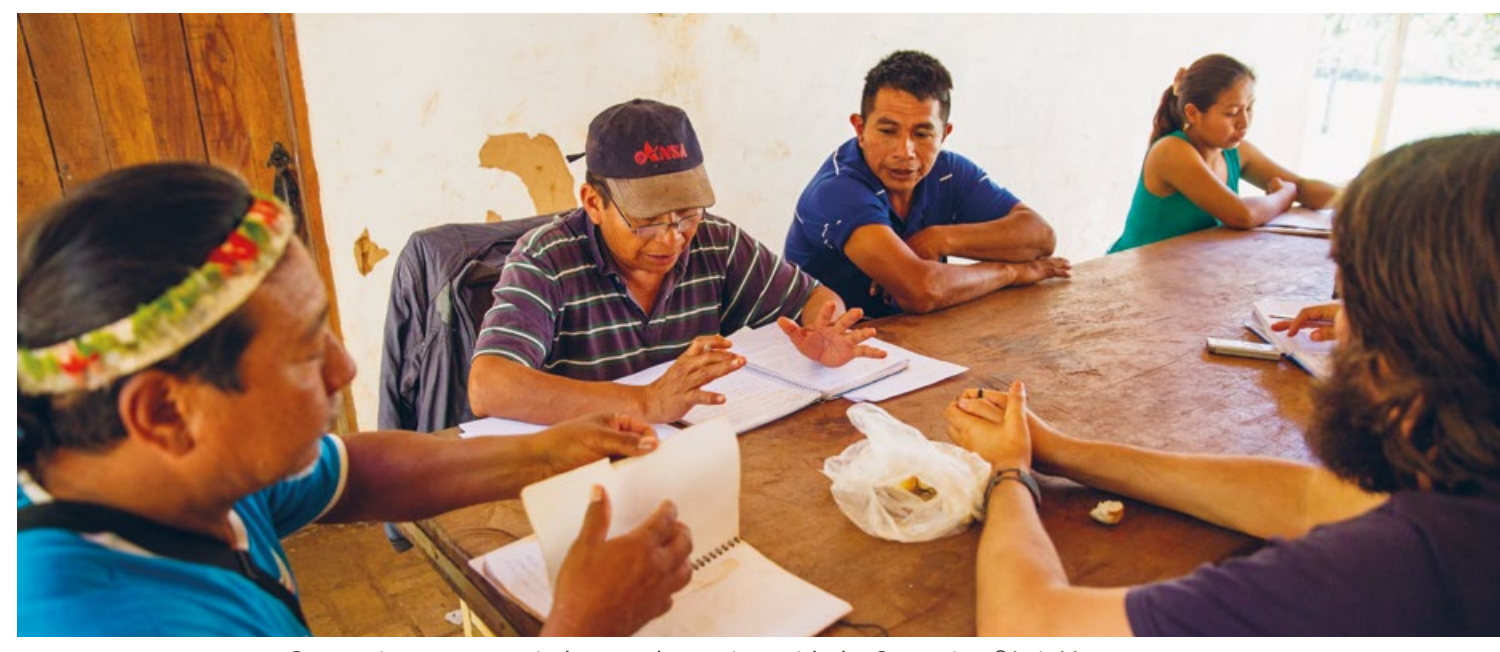
Companies must now sit down and negotiate with the Guarani.

In addition, it will be crucial that regulators demand full transparency on products for sale about the process used to produce any steviol glycosides that these products contain. There would be a backlash against the use of Stevia and Steviol glycosides as a sweetener if steviol glycosides originating from plants and synthetically produced steviol glycosides could not be differentiated by consumers.