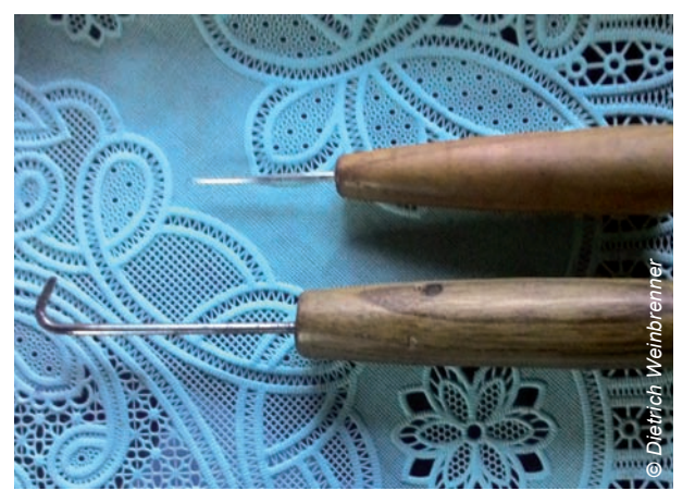
Rights. If the wage paid by PT Prima Dinamika Sentosa, for example, is even lower than the statutory minimum wage, this is also a violation of Indonesian law.

With the exception of the workers at PT Ecco, all respondents said that their wages including overtime pay are not enough to cover basic needs, leading to a large workload as workers depend on overtime pay to survive. In addition, every regional minimum wage in Indonesia is by far lower than the living wage. Wages paid by PT Mekar Abadi Sentosa, for example, are supposed to be close to the regional minimum wage, however, workers must work six days a week. Moreover, the minimum wage for 2016 was only 60 % of the living wage for that region, as calculated by the Ministry of Labour for 2012. The fact that most respondents do not earn enough to cover basic needs despite working overtime is a violation of Art. 23 (3) of the Universal Declaration of Human