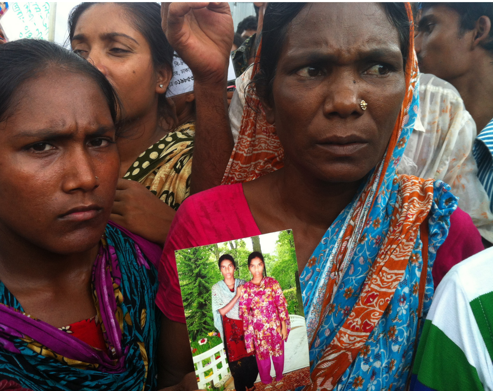
Family members of Rana Plaza building collapse victims.

On April 24, 2013, the Rana Plaza building in Dhaka, Bangladesh, which housed five garment factories, came crashing down, claiming at least 1,132 lives. Cracks had appeared in the wall the previous day, yet thousands of garment workers were forced to return to work in the factories housed on the upper floors.