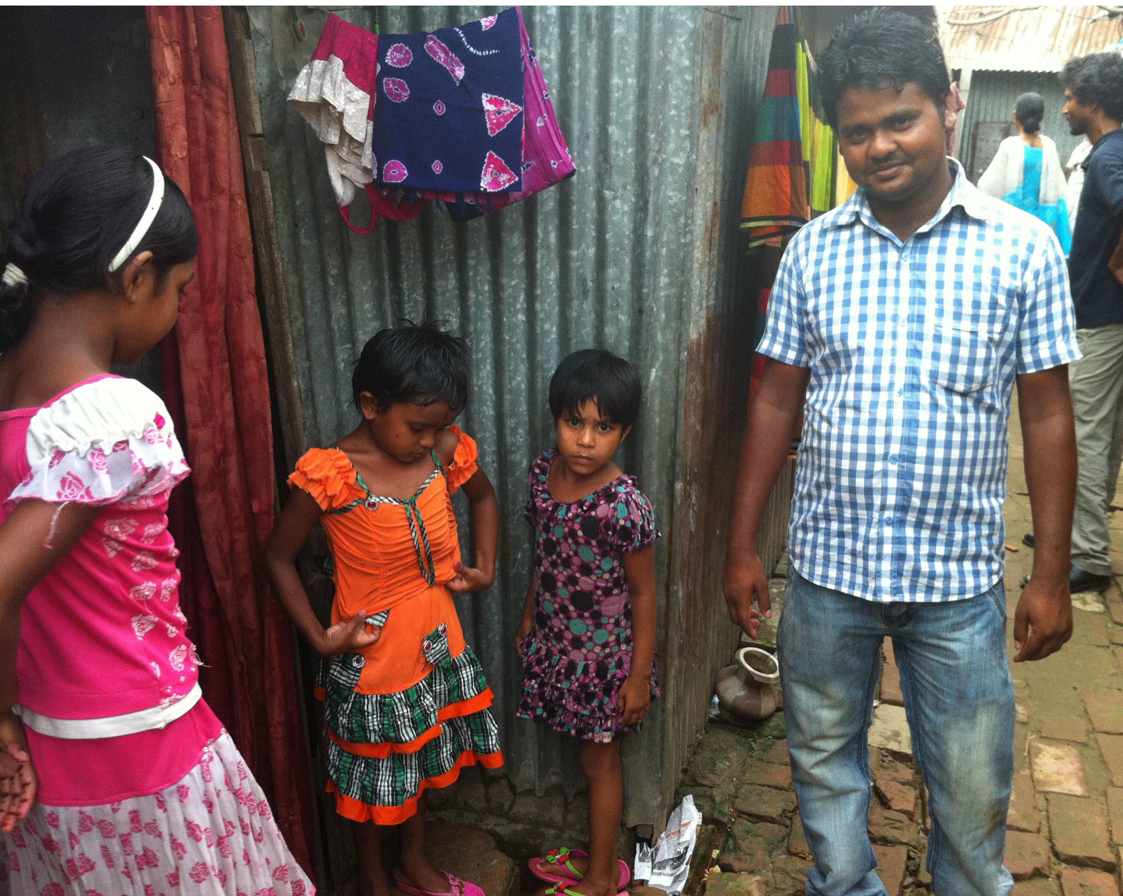
Garment workers live in concentrated housing communities. Many families live in one-room structures beside dozens of other families with whom they share common kitchen, water, and bathing areas.

“WE HAVEN’T BEEN ABLE TO PAY OUR RENT... ALREADY SOME PEOPLE HAVE LOST THEIR ROOM.”