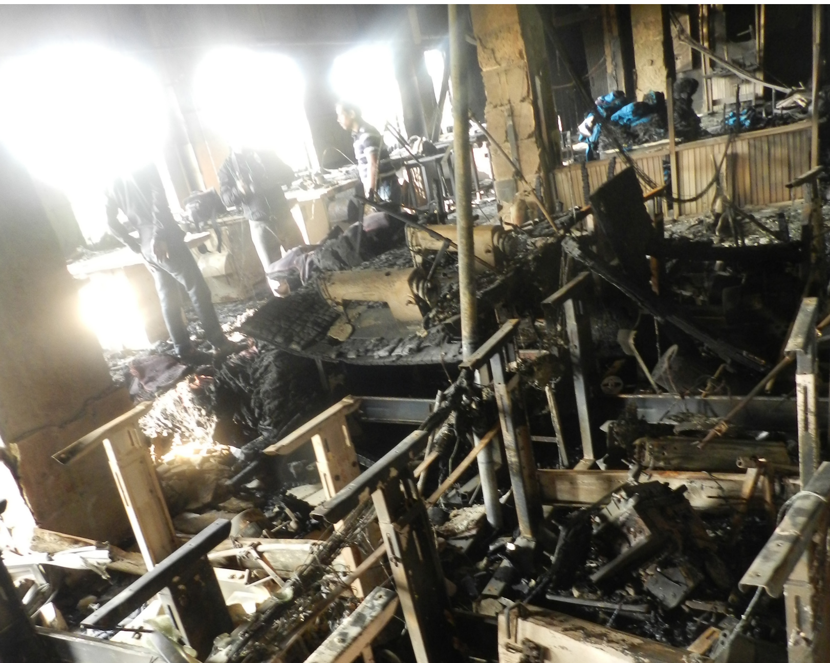
Inside Tazreen Fashions, the day after the factory fire.