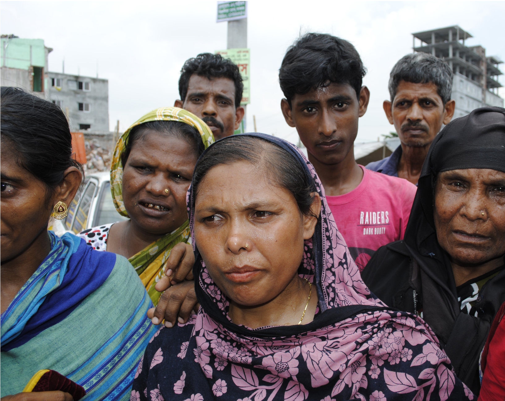
Affected family members.