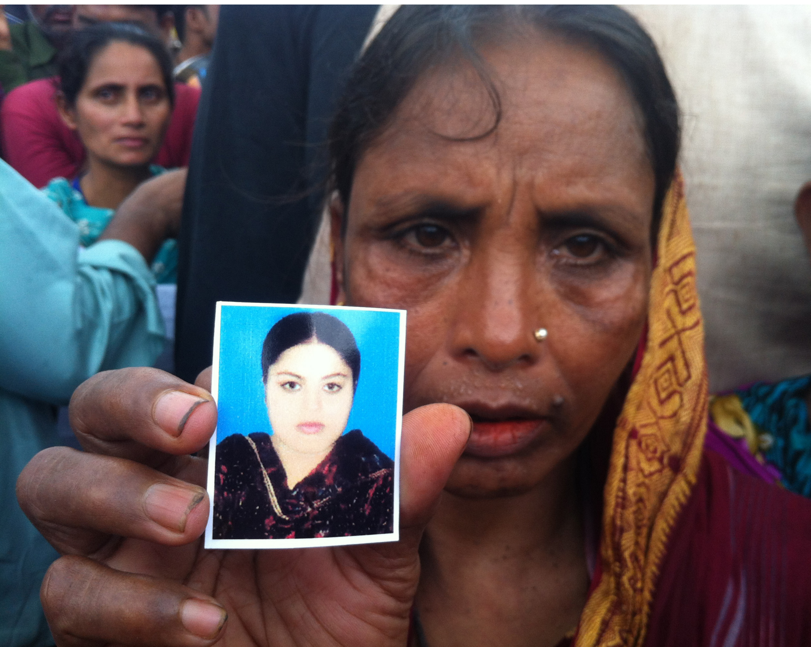
A mother mourns the loss of her daughter at Rana Plaza.