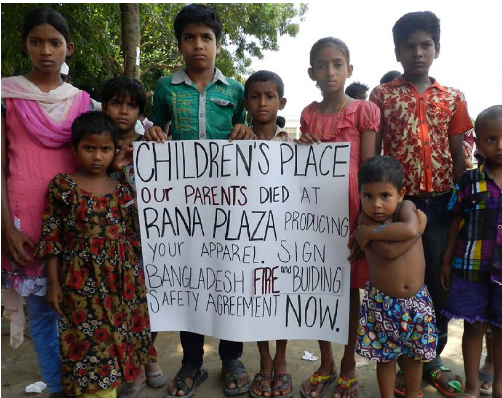
Orphans call on Children's Place to pay the compensation they owe and to sign onto the Safety Accord.

In April 2013 the world said never again to another Rana Plaza. Yet already, 16 lives have been lost in building fires since then. If we are to avoid another colossal tragedy, all must play their part in making the changes needed to turn the Bangladesh garment industry into the sustainable, just and safe industry that these four million workers deserve.