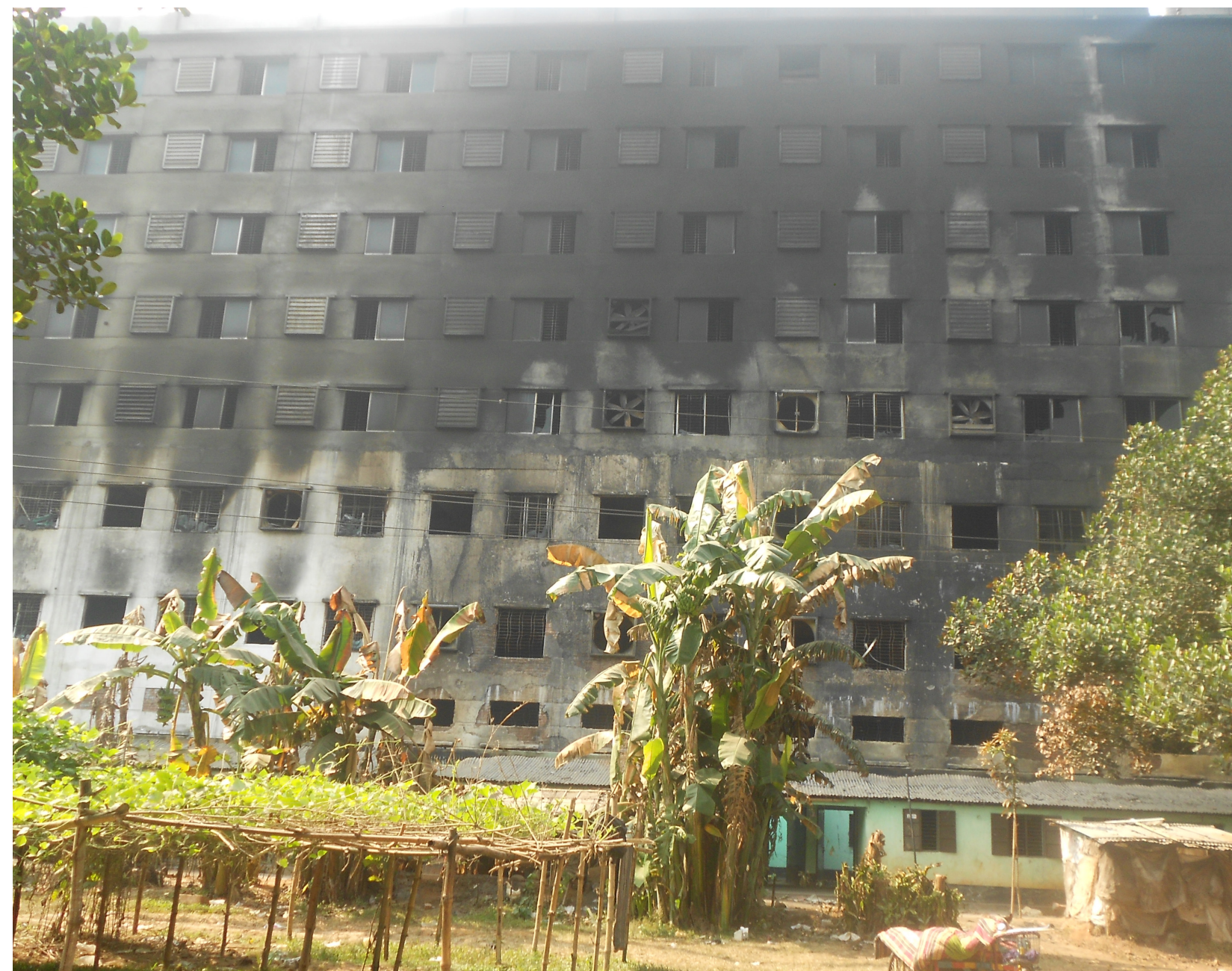
Tazreen Fashions factory, after the fire.

All the US corporations including Walmart, Sears/Kmart, Enyce (Sean John Apparel), Delta Apparel, Dickies and Disney along with French brand Teddy Smith, have refused to pay any compensation to the victims, have failed to attend the meetings on Tazreen compensation and have not been willing to engage with trade unions directly to arrive at full and fair compensation for Tazreen victims.