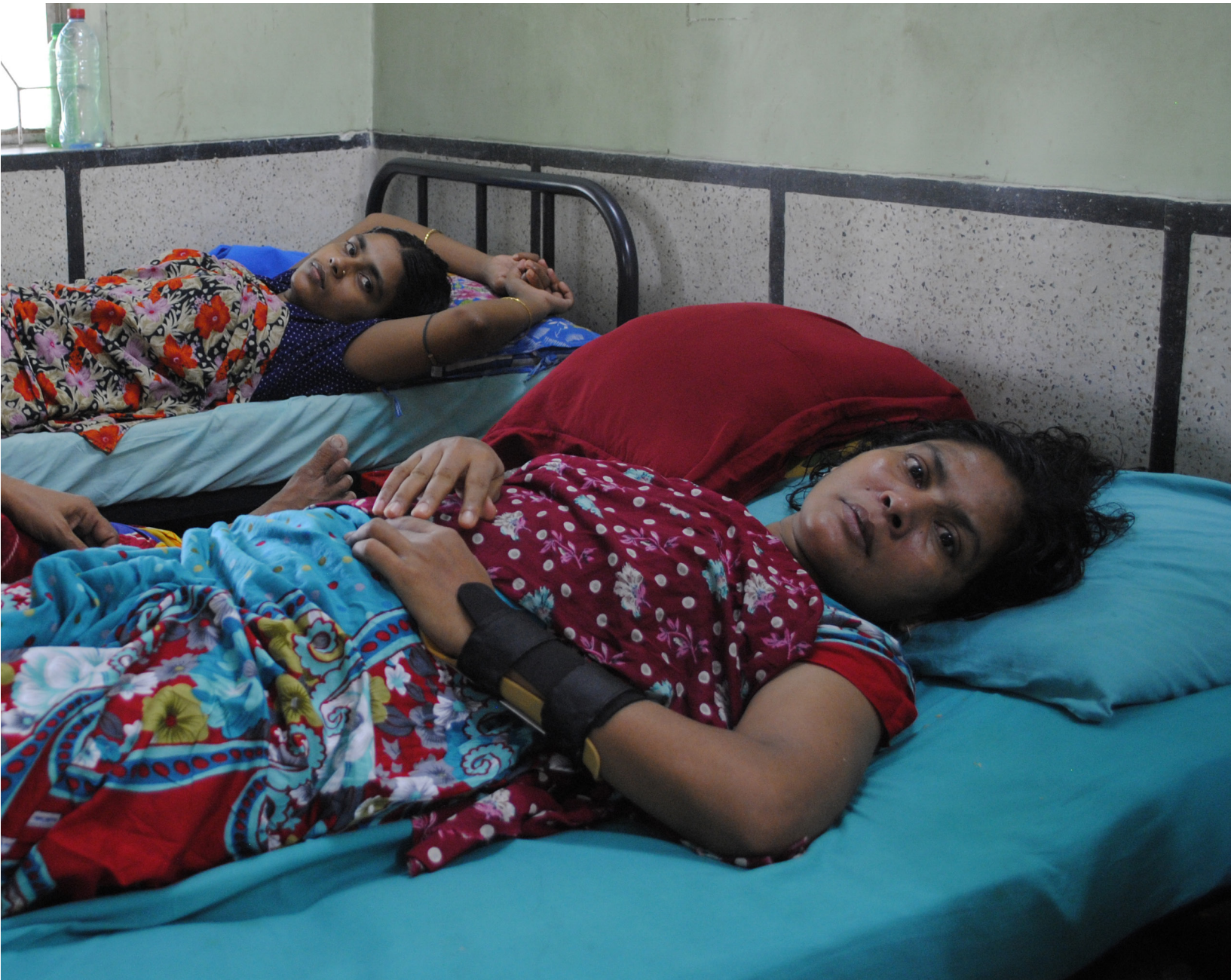
Workers who were injured in the building collapse.

The Bangladesh Garment Manufacturers and Exporters Association claims that 2,759 workers were provided their owed salaries including overtime and benefits. The payment that workers received included an average of 60 overtime hours. Hundreds of workers did not receive any wages at all. Many workers had to surrender their factory identification cards when collecting unpaid salary, and they now remain concerned that this will prevent them from accessing further compensation once it becomes available.