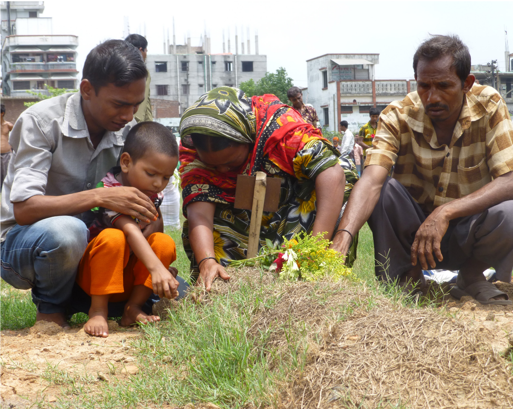
A family of a Tazreen garment worker visits the Jurain graveyard. They have yet to receive the full compensation due to them.