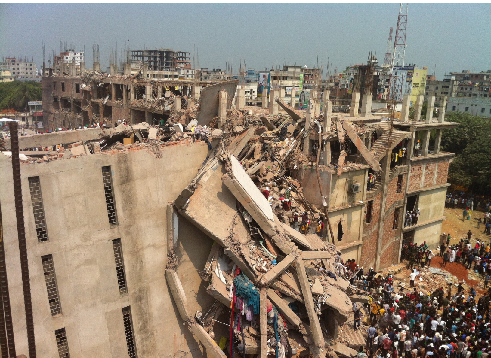
Rana Plaza building collapse, April 24, 2013.

Six months after the Rana Plaza building collapse and eleven months after the Tazreen Fashions fire, the injured workers and the families who lost loved ones face immense financial hardship. In addition to the physical pain and psychological trauma, they are suffering from loss of income while continuing to await full and fair compensation from government, factory owners, and European and North American brands and retailers.