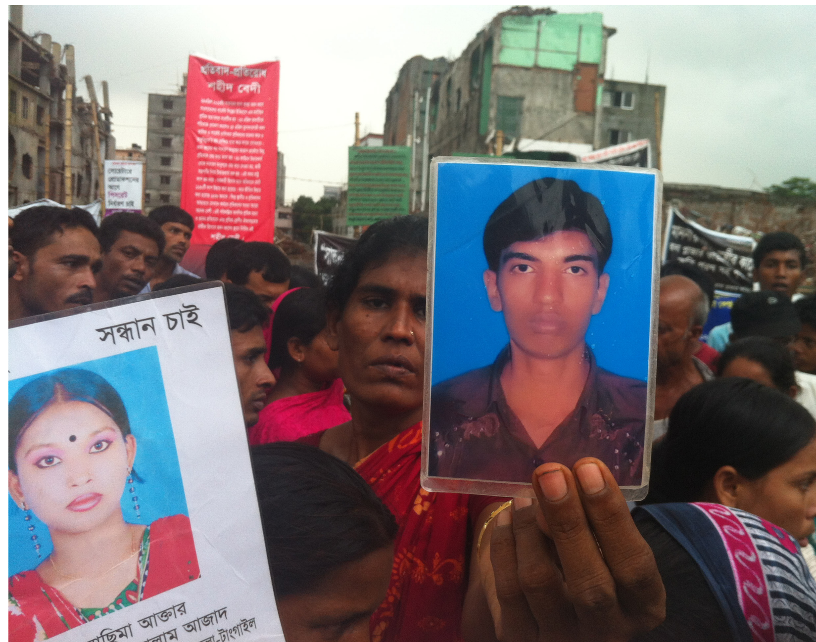
Demonstration in front of Rana Plaza on the International Day of Action to End Deathtraps, June 29, 2013.

The ILO sent a high level expert delegation to Dhaka in the first week of October to discuss matters with the government and all stakeholders concerned.