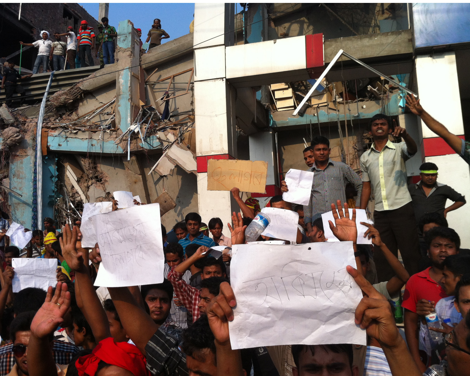
Amidst rescue efforts at Rana Plaza, workers call for help.

In addition to the compensation initiatives detailed above, in recent months several other initiatives have taken off in the Bangladesh garment industry in the areas of safety, labour law, and wages. This section summarizes key efforts in these areas.