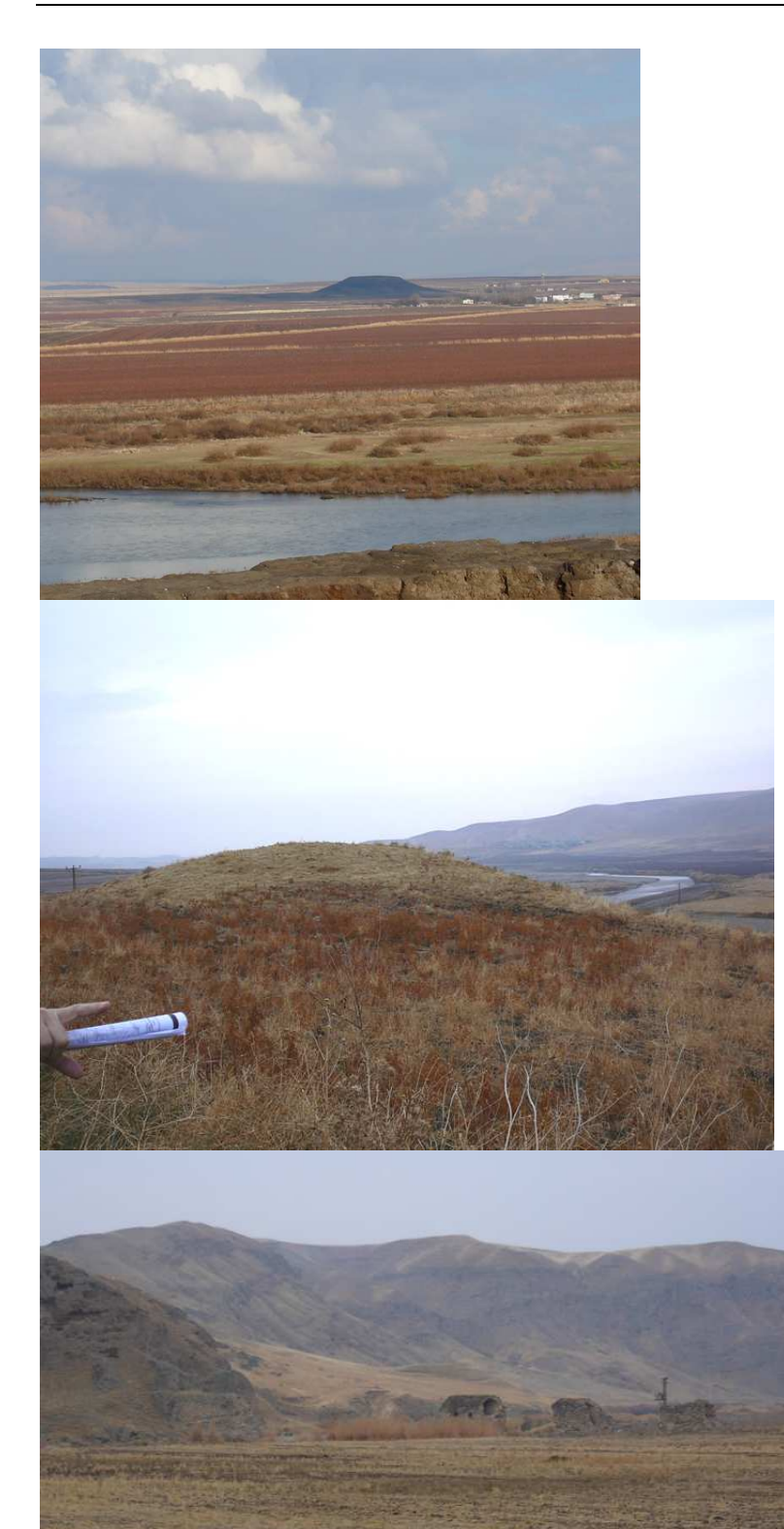
Photo 7: Bismil area, view at the mound Gre Dimse. The mound will be affected by the reservoir and needs further archaeological investigations.