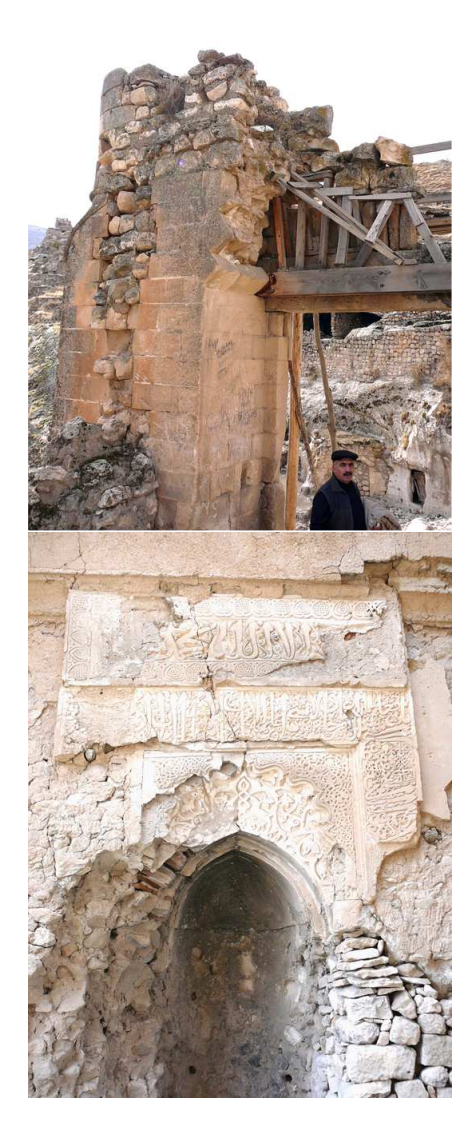
Photo 4: Hasankeyf, arch of an outer wall of the Büyük Saray. The arch is endangered from collapse. The building needs immediate conservation treatment.