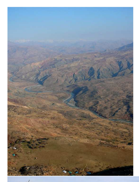
Photo 10: Upper Botan valley. During several important historical periods the mountainous region of the Bismil valley served as natural border between East and West. It has a high historical potential and needs further surveys and