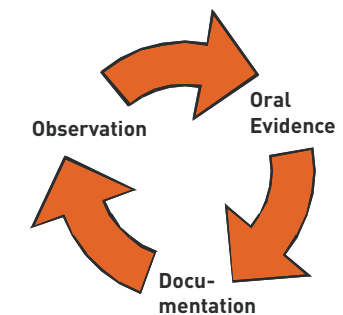
Figure 1 Circle of Evidence